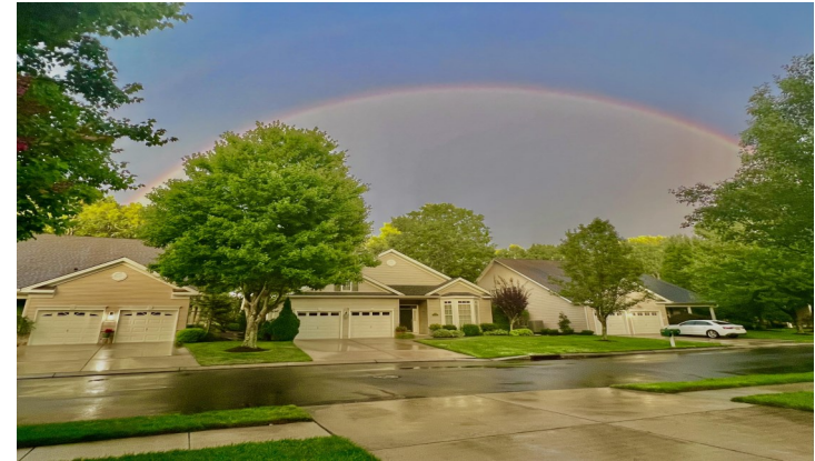
This photo was taken by Stephen Hogan on St. Andrews after a storm on August 15th.